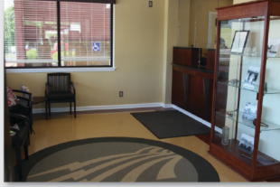
Franklin Office 106 Davis St. Franklin On Franklin town square