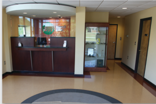
Buchanan Office 3161 S. Hwy. 27 Buchanan