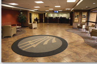
Carrollton Office 155 N. Hwy. 113 Carrollton