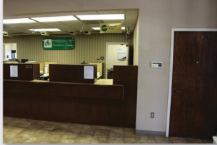
Villa Rica Office 725 W. Bankhead Hwy. Villa Rica Lobby of Bank of the Ozarks